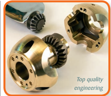
Top quality engineering

On completion, the mould is dewaxed leaving an empty shell which is subsequently fired and filled with aluminium bronze (AB2) for the body, centre shaft metal and stainless steel blades, the shell is then allowed to cool and removed. Castings are cut from the riser/runner system, finished, the blades are then heat