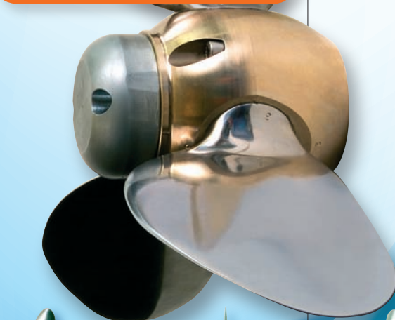
Blades in position for run ahead

Use our template to check size compatibility