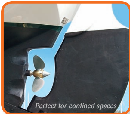
Perfect for confined spaces

FeatherStream fully feathering propellers are made in the UK by Darglow Engineering in Wareham Dorset. They range from 12" to 20" diameter, all with three feathering blades.