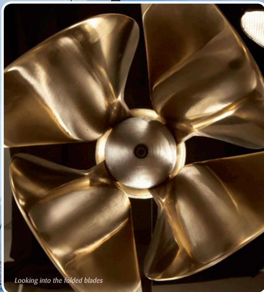
Looking into the folded blades