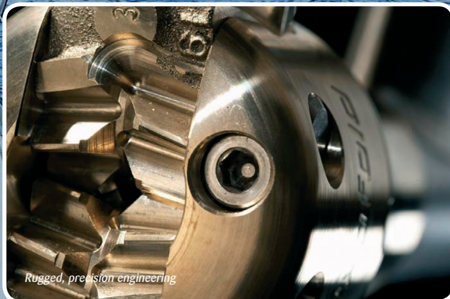
Rugged, precision engineering